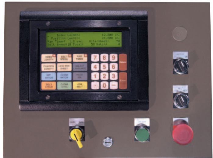
Control panel on moveable console with digital readout

We also manufacture laminating equipment and band saws to meet all of your fabricating needs. Contact us today for more information.